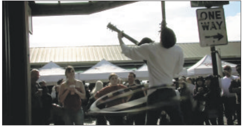
SPECIAL TO THE DAILY