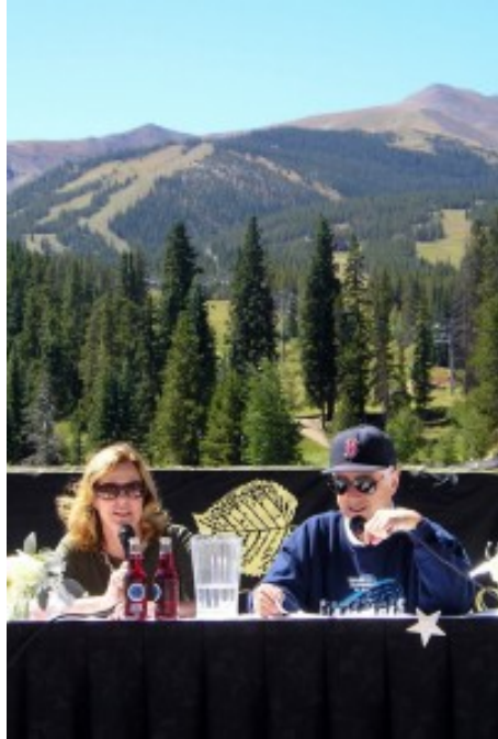
JoBeth Williams & Jeffrey Lyons participate in an outdoor film forum with the picturesque mountains of Breckenridge in the background.

DB Sweeney. This year's festival promises even more big screen experiences that will delight the kids, inspire the adventurous, and educate those that would like to learn a bit more about film making. So whether your tastes run to drama or comedy, documentary or fantasy, with a setting in the picturesque mountains of Breckenridge, what's not to love about this film festival?