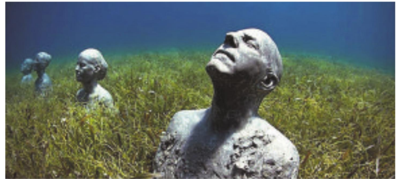
JASON DECAIRES TAYLOR / SPECIAL TO THE WEEKENDER

The film ‘Angel Azul’ follows artist Jason deCaires Taylor as he creates underwater sculptures to help rehabilitate coral reefs. The film will be shown at the Breckenridge Film Festival in September.