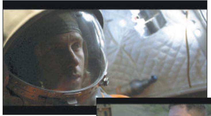
Russian cosmonaut Alexander is adrift in orbit around Earth in ‘Into the Silent Sea,’ a film showing at the Breckenridge Film Festival this month.

Learn more about this and other films online at www.breckfilmfest.com . Do you want to sponsor this film at the annual Breckenridge Film Festival? Email info@breckfilmfest.com for information. The Breckenridge Film Festival will bring more than 50 independent films, their filmmakers and festival-goers to Breckenridge from Sept. 18-21. Featuring chances to meet filmmakers, panel discussions, plenty of parties and mingling, and — back this year — the Adventure Reel for young and young-at-heart audiences.